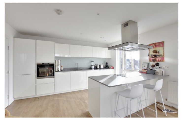
BOWSPIRIT APARTMENTS, DEPTFORD, LONDON, SE8 £430,000 LEASEHOLD

A MAGNIFICENT AND LARGE ONE BEDROOM, 7TH FLOOR, APARTMENT THAT MEASURES CIRCA 624 SQ. FT. AND BOASTS FANTASTIC, WEST FACING VIEWS ACROSS LONDON AND THE RIVER! EWS1 COMPLIANT B1 RATING!