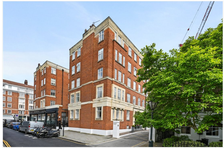
EDWARDES SQUARE, W8 £995,000 LEASEHOLD

AN IMMACULATELY PRESENTED TWO BEDROOM FLAT SITUATED ON THE FIRST FLOOR (WITH LIFT) OF A WELL MAINTAINED PORTERED BLOCK WITH ASSESS TO THE DELIGHTFUL EDWARDES SQUARE COMMUNAL GARDENS.