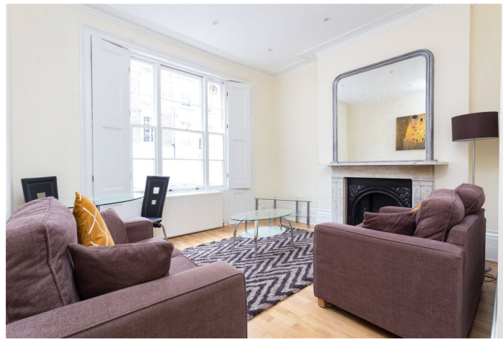
ALMEIDA STREET, ANGEL, N1 £445 PER WEEK FURNISHED