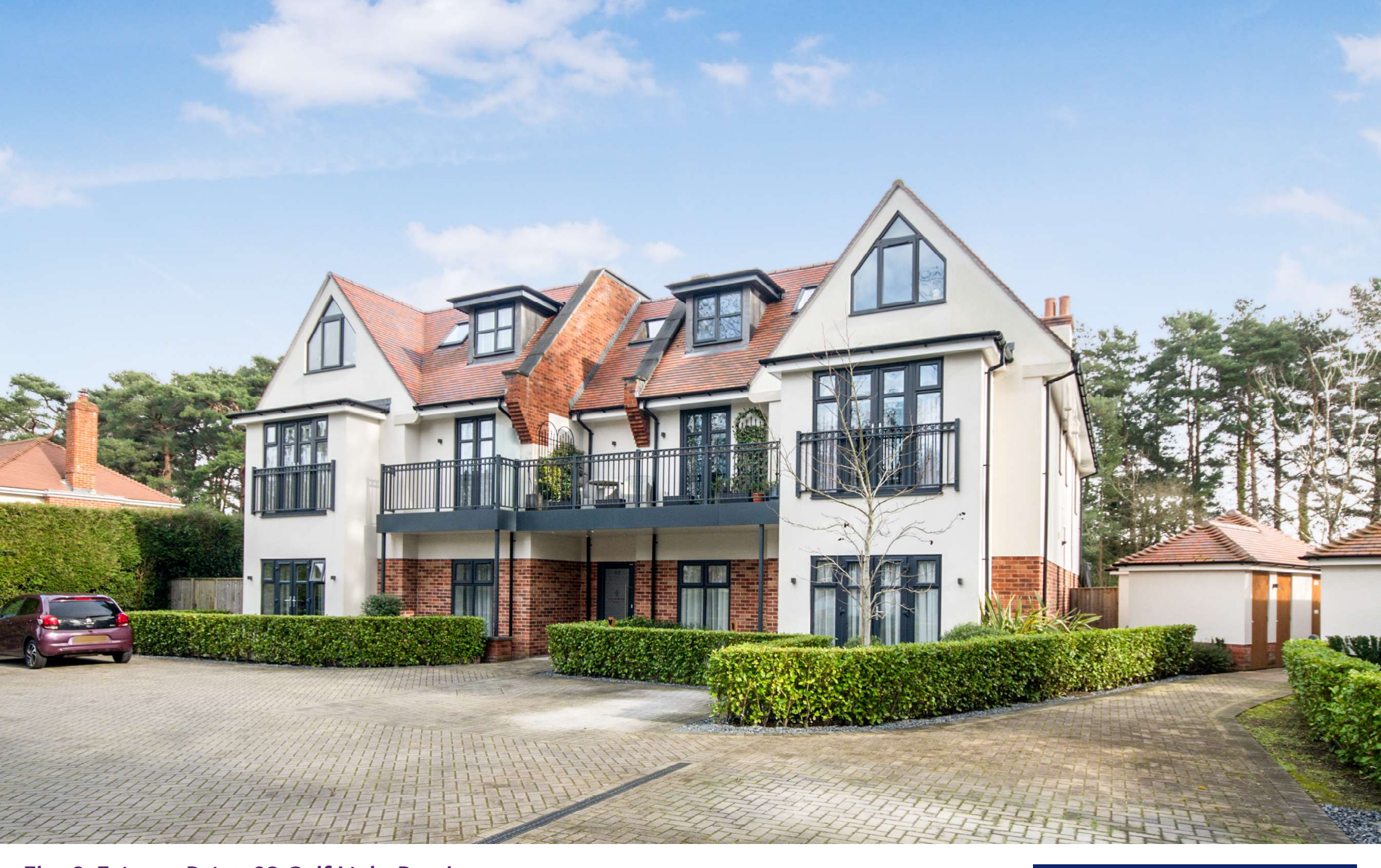
Flat 8, Fairway Point, 93 Golf Links Road Ferndown BH22 8BU