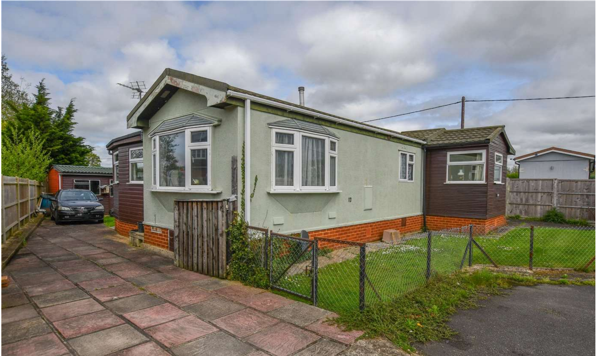
12 GROVELANDS PARK, WINNERSH, WOKINGHAM, BERKSHIRE, RG41 5LD £195,000