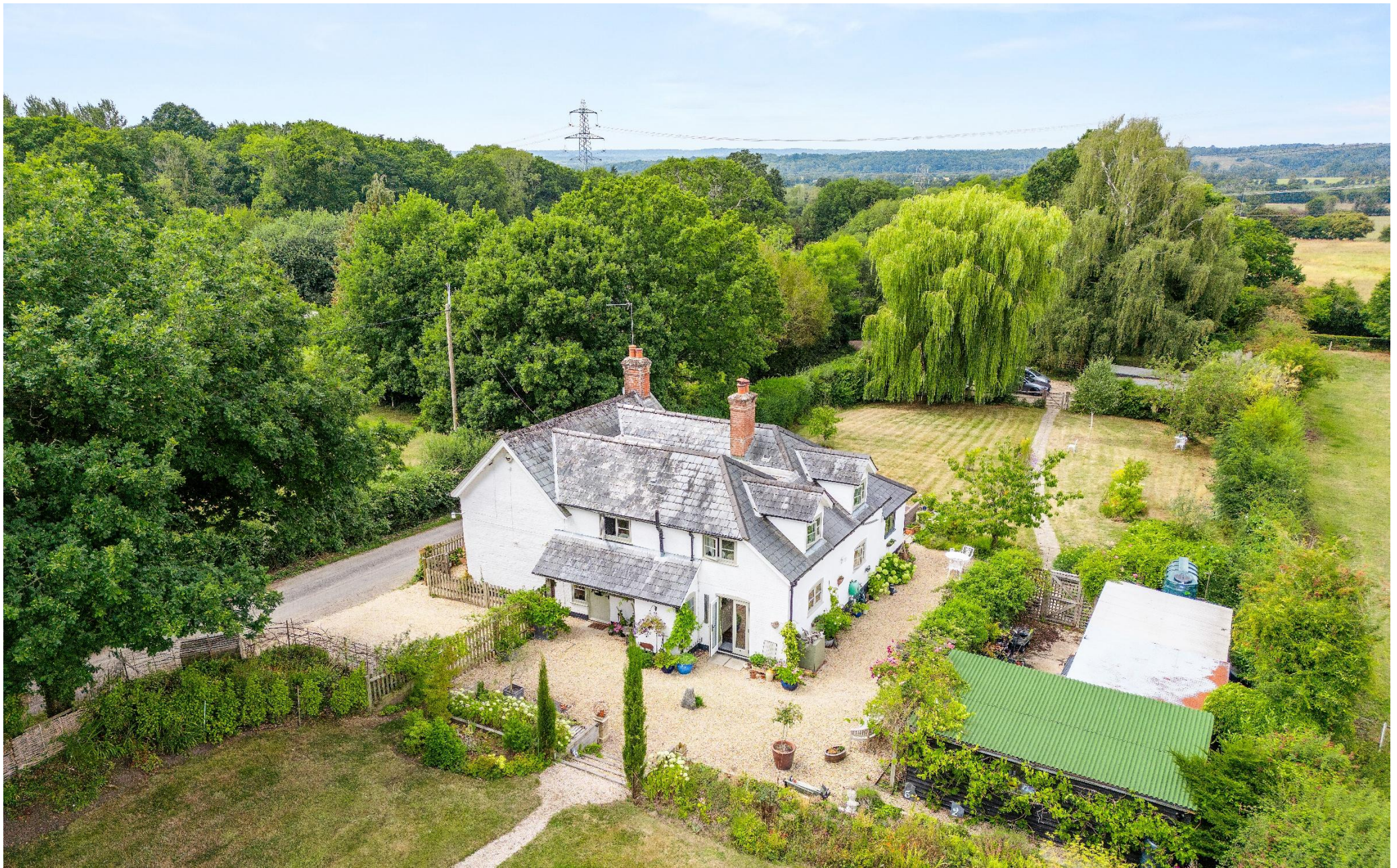
The Dolls House, Toothill Road, Romsey SO51 9LN Offers in Excess of £1,100,000