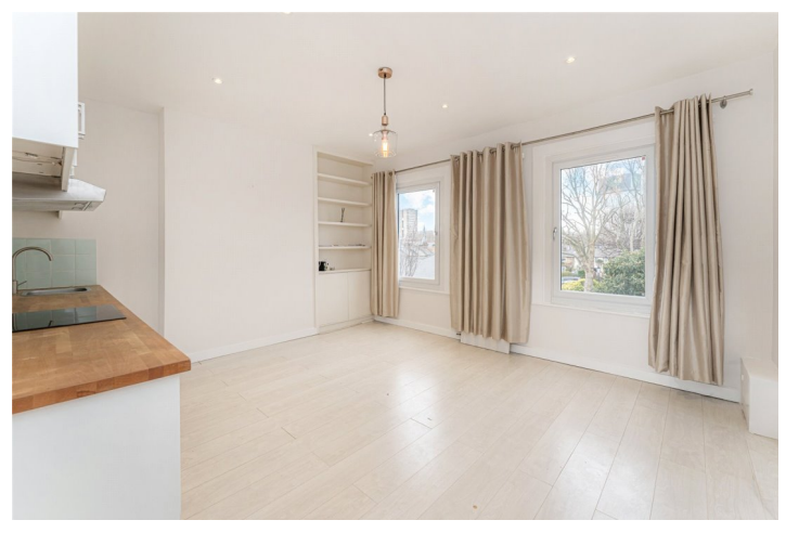
MARY PLACE, W11 £425,000 LEASEHOLD