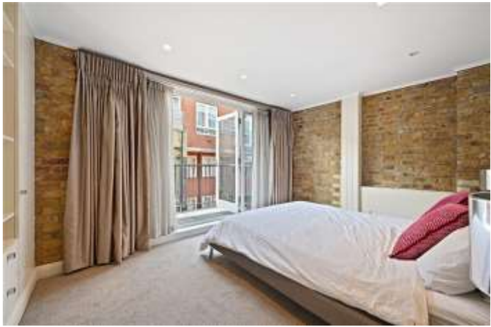
TOWER STREET, COVENT GARDEN, LONDON, WC2H £1,600,000 LEASEHOLD APPROX. 98 YEARS REMAINING

A LIGHT AND ELEGANT SECOND FLOOR TWO BEDROOM TWO BATHROOM SPLIT LEVEL APARTMENT IN A BEAUTIFULLY POSITIONED BUILDING IN THE PRIME HEART OF COVENT GARDEN.