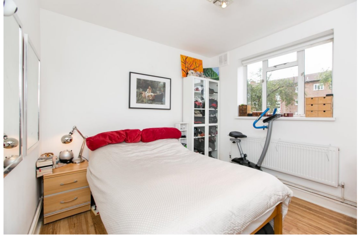
FLAT 20, ALLOM HOUSE, CLARENDON ROAD, LONDON, W11 £1,495 PER MONTH FURNISHED