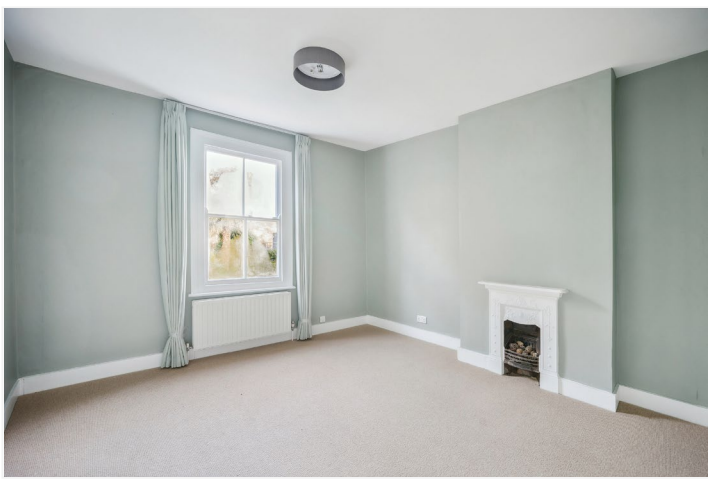
TRINITY RISE, SW2 £3,000 PER MONTH UNFURNISHED