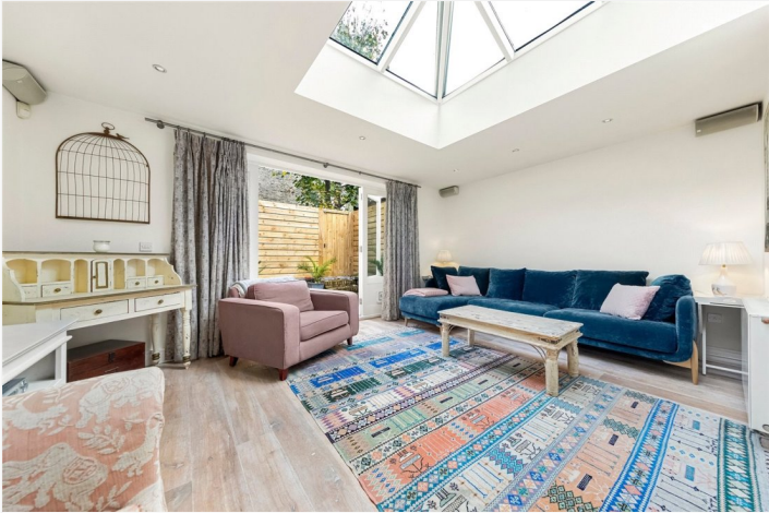
CHELVERTON ROAD, SW15 £2,950 PER MONTH FURNISHED