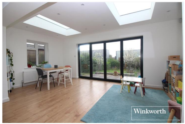
GATESHEAD ROAD, HERTFORDSHIRE, WD6 £535,000 FREEHOLD