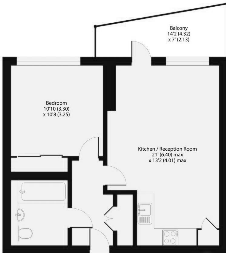
Hawthorne Crescent, SE10 Approximate Area = 518 sq ft / 48.1 sq m For identification only - Not to scale