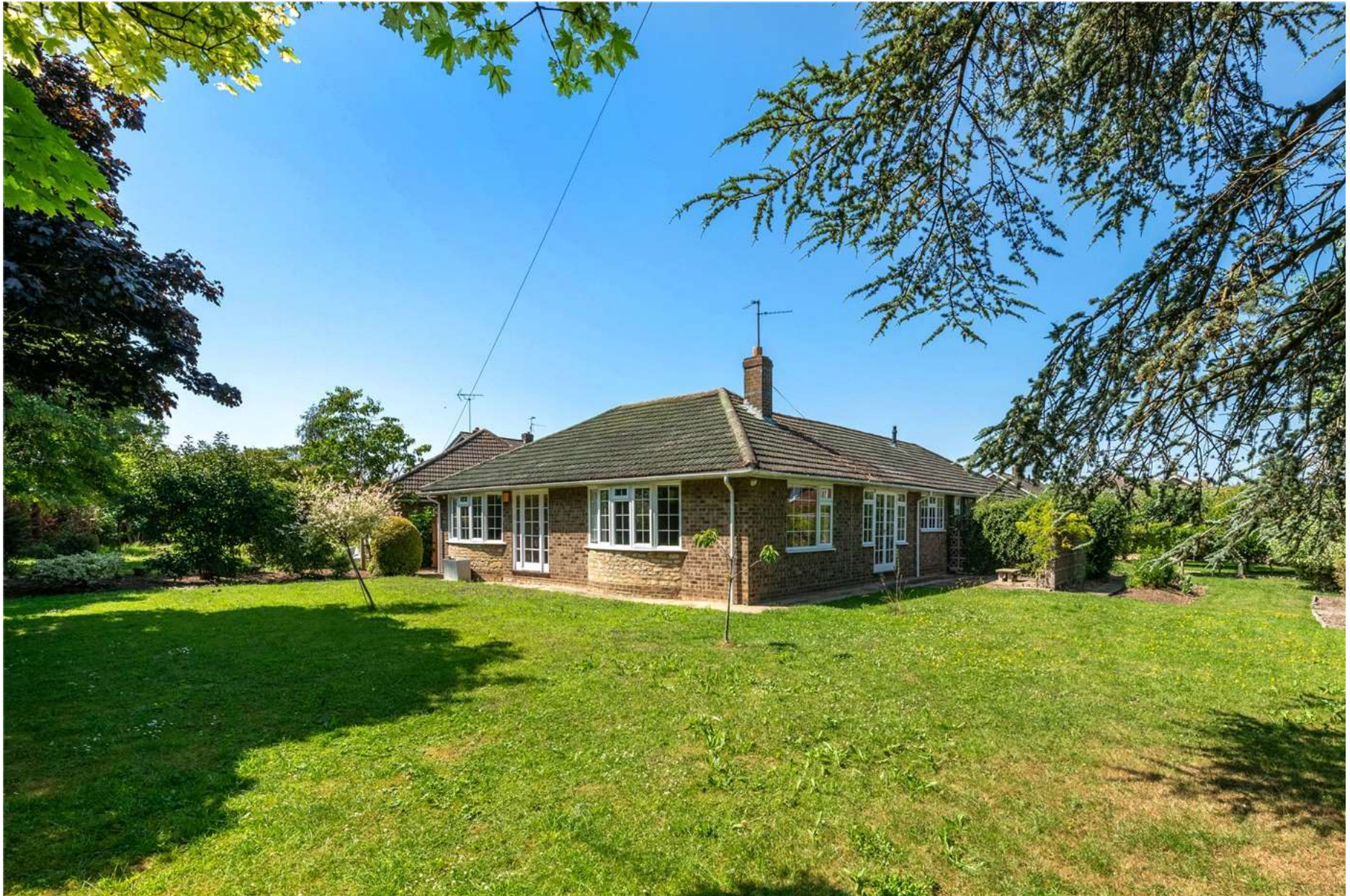
27 FIR AVENUE, BOURNE, PE10 9RY £375,000 FREEHOLD