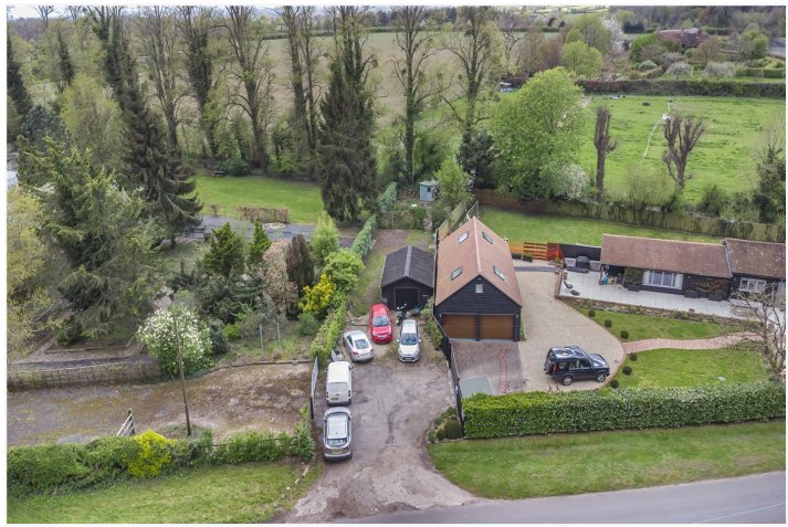
COLLINS END, GORING HEATH, READING, RG8 £685,000 FREEHOLD