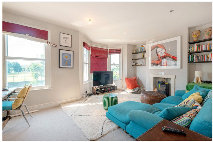
PAVILION TERRACE, LONDON, W12 £3,900 PER MONTH