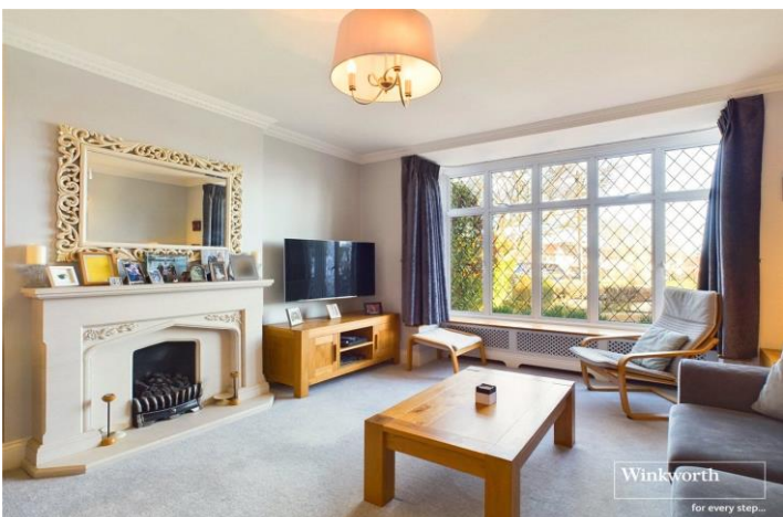
LITTLETON CRESCENT, HARROW, MIDDLESEX, HA1 £1,700,000 FREEHOLD