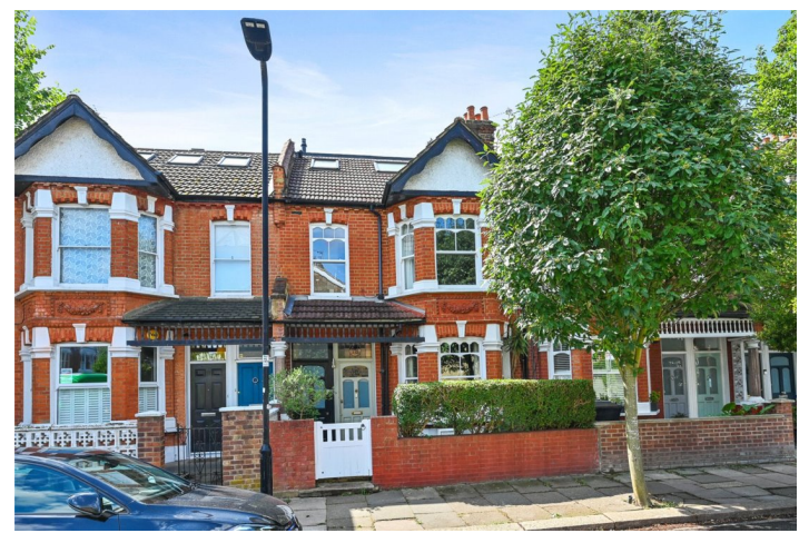
VALETTA ROAD, W3