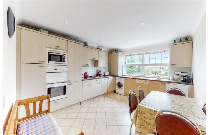
AMBASSADOR COURT, BRENT STREET, HENDON, NW4 £995,000 LEASEHOLD