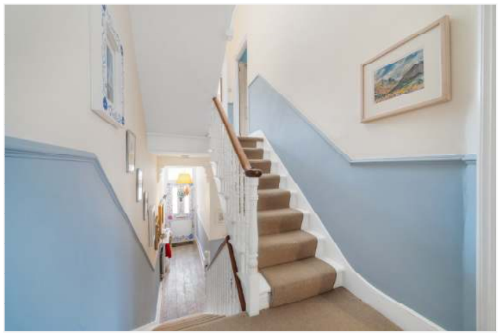
FRIERN ROAD, EAST DULWICH, LONDON, SE22 OIEO £1,400,000 FREEHOLD