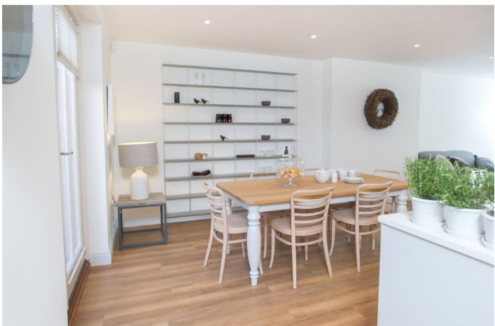
5 ST THOMAS PLACE, OLD RUTTINGTON LANE, CANTERBURY, CT1 £2,200 PER MONTH UNFURNISHED