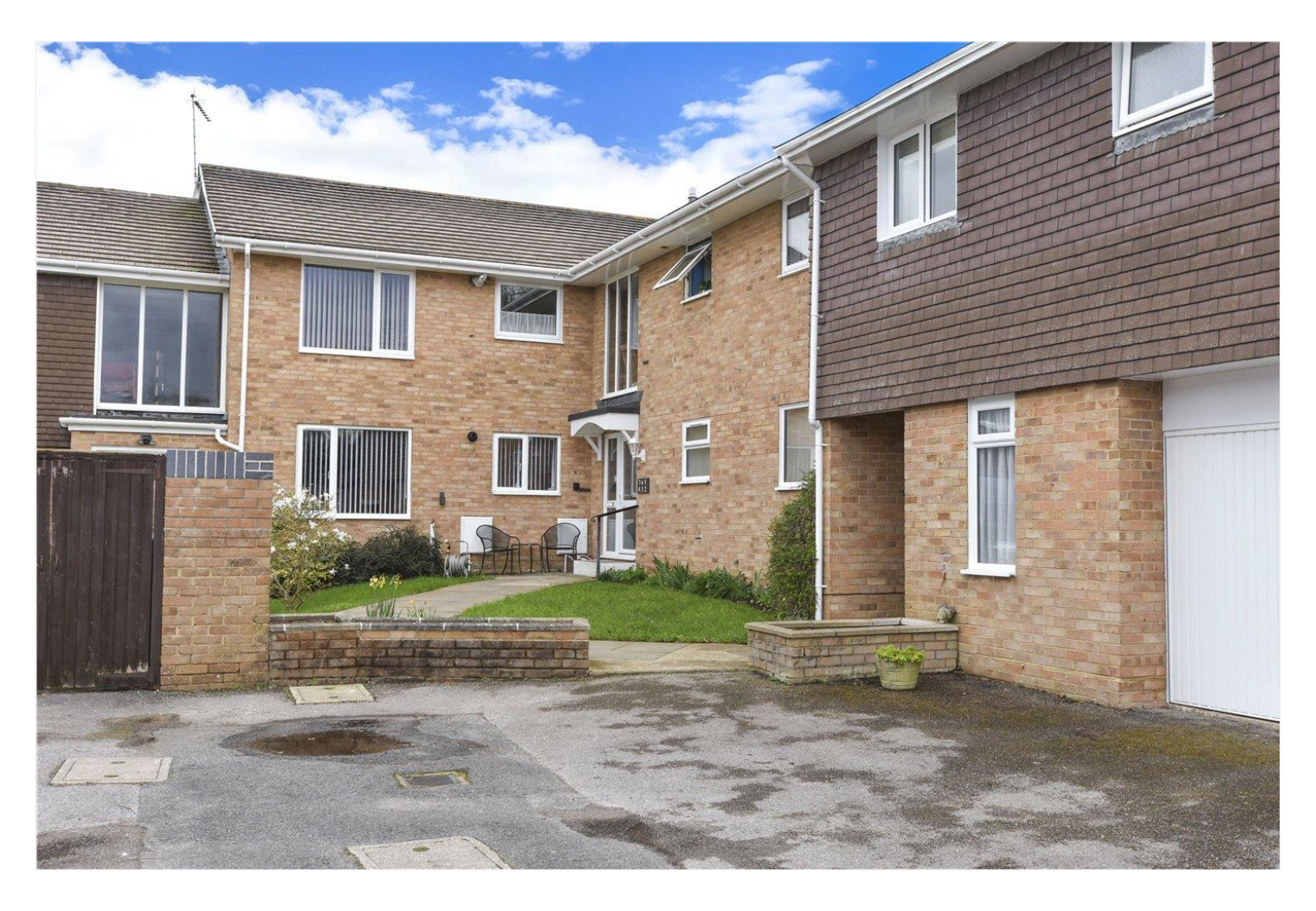
FLAT 7, FOXCROFT, 77 MERLEY LANE, MERLEY, WIMBORNE, DORSET, BH21 3AZ £235,000 SHARE OF FREEHOLD

A SPACIOUS 2 DOUBLE BEDROOM FIRST FLOOR FLAT WITH A GARAGE, FOR SALE WITH NO FORWARD CHAIN, IN A PURPOSE- BUILT COMPLEX OF 9 SET IN LANDSCAPED COMMUNAL GARDENS, ADJACENT TO A PARADE OF SHOPS AND A DOCTORS' SURGERY. AT A GLANCE