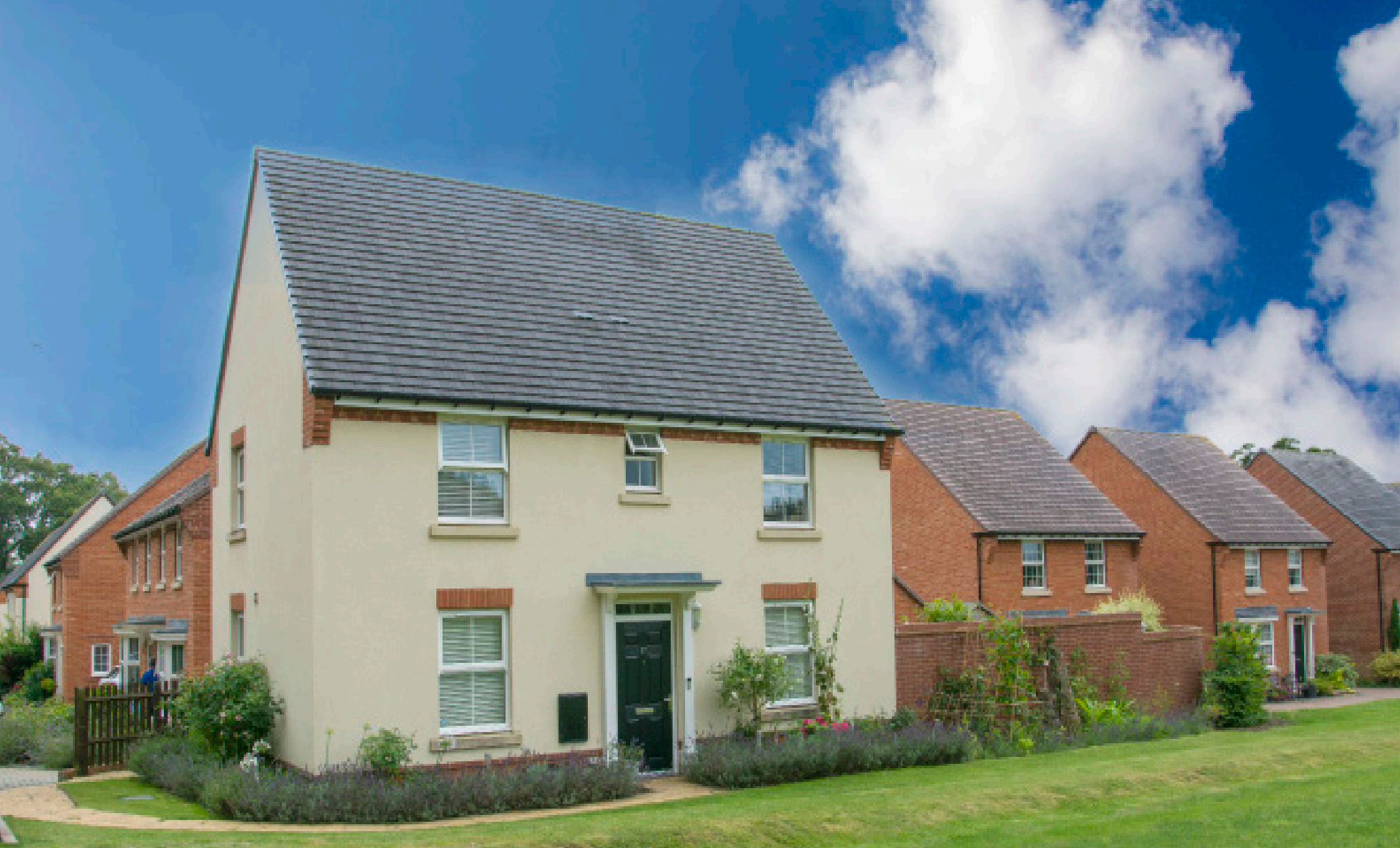
17 Coppins Close Ferndown, BH22 8FA GUIDE PRICE £495,000