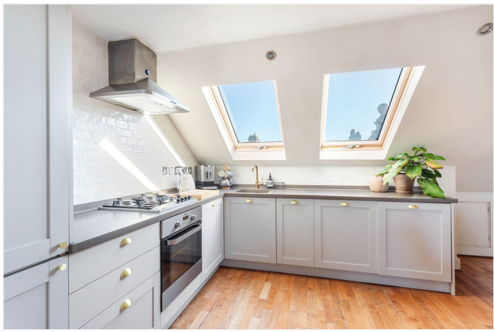
MOORCROFT ROAD, SW16 £1,750 PER MONTH PART FURNISHED