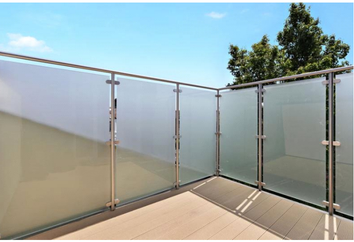
COLLINGBOURNE ROAD, LONDON, W12 £3,100 PER MONTH FURNISHED £3,100 PER CALENDAR MONTH

A stunning three double bedroom, two bathroom apartment arranged over two floors with private terrace. Furnished, available 14th August 2025