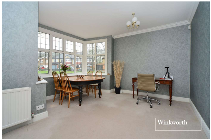
WICKHAM AVENUE, CHEAM, SUTTON, SM3 £1,100,000 FREEHOLD

AN IDEAL FAMILY HOME LOCATED ON A HIGHLY SOUGHT AFTER ROAD AND BENEFITTING FROM FIVE DOUBLE BEDROOMS AND SPACIOUS GROUND FLOOR ACCOMODATION