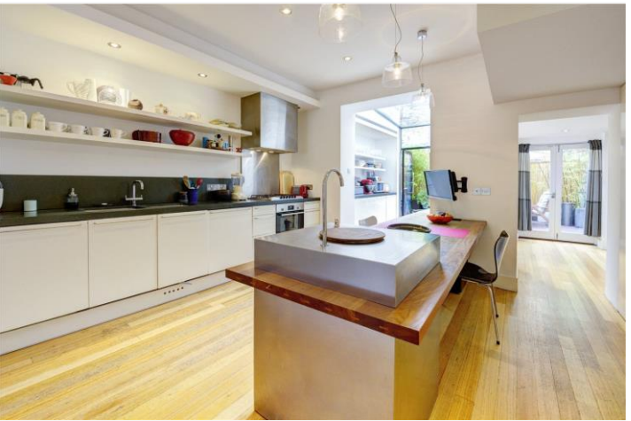
SUTHERLAND PLACE, W2 £4,750,000 FREEHOLD

A FIVE STOREY FAMILY HOUSE WITH SEPARATE FLAT, IN THIS EVER POPULAR, PEACEFUL NOTTING HILL SPOT.