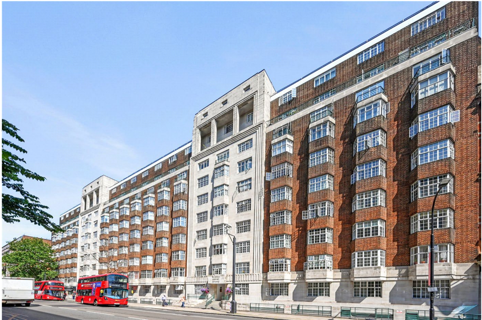
WOBURN PLACE, BLOOMSBURY, WC1H £355,000 SHARE OF FREEHOLD