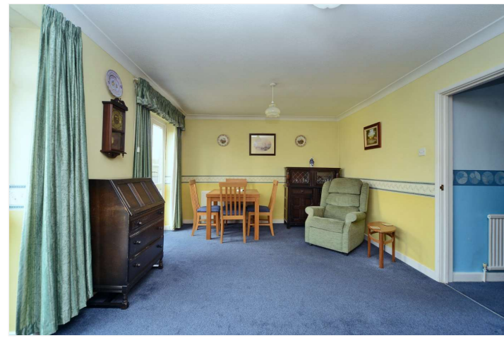
WORCESTER ROAD, SUTTON, SM2 £575,000 FREEHOLD

A SPACIOUS, FOUR DOUBLE BEDROOM PROPERTY CLOSE TO WELL-REGARDED SCHOOLS AND CHEAM MAINLINE TRAIN STATION