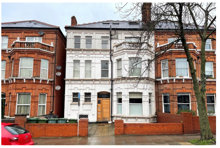
FLAT 6, MINSTER ROAD, LONDON, NW2 £589,950 LEASEHOLD