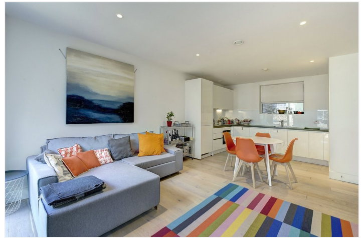
ATRIUM APARTMENTS, LONDON, W10 £500,000 LEASEHOLD