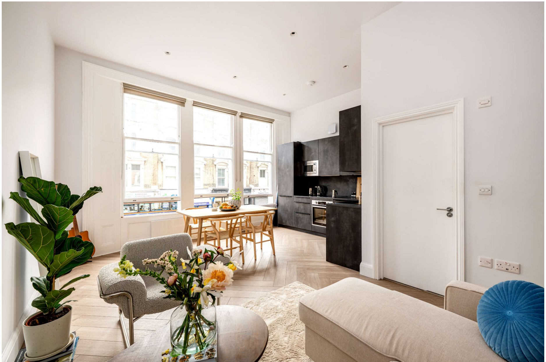
LADBROKE GROVE, LONDON, W10 £2,350 PER MONTH