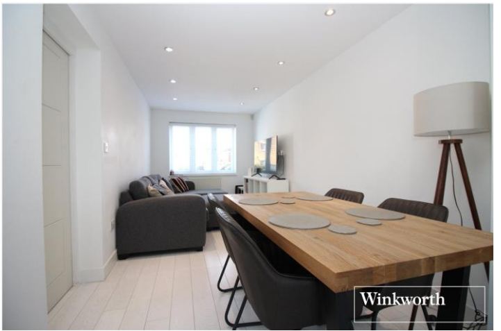
COLERIDGE WAY, HERTFORDSHIRE, WD6 £665,000 FREEHOLD