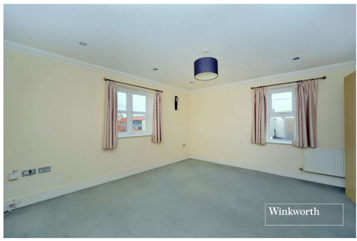
TATE ROAD, SUTTON, SM1 £300,000 LEASEHOLD

A TWO BEDROOM, TWO BATHROOM APARTMENT IDEALLY LOCATED CLOSE TO WEST SUTTON TRAIN STATION AND SEVERAL WELL-REGARDED SCHOOLS