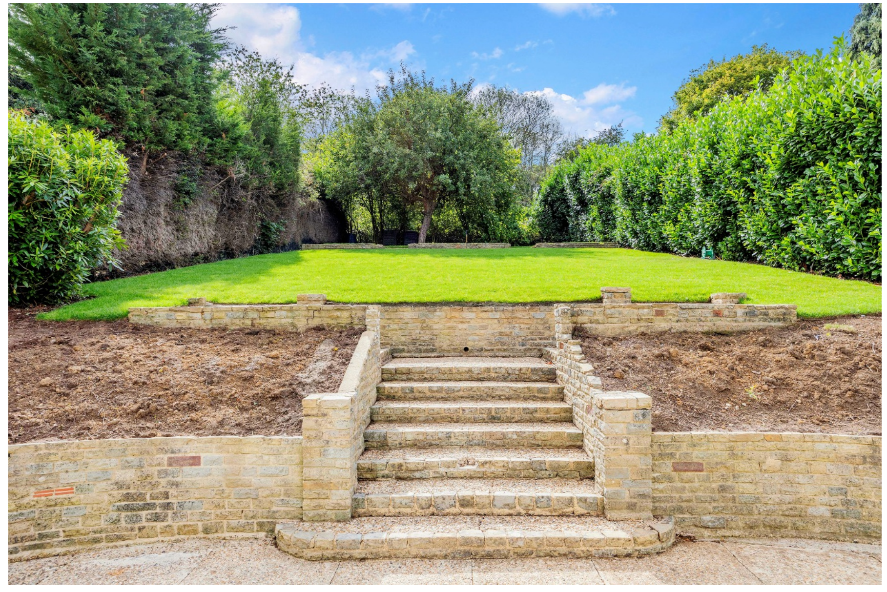
Under the Property Misdescriptions Act 1991, these Particulars are a guide and act as information only. All details are given in good faith and are believed to be correct at time of printing. Winkworth give no representation as to their accuracy and potential purchasers or tenants must satisfy themselves by inspection or otherwise as to No employee of Winkworth has authority to make or give any representation or warranty in relation to this property.