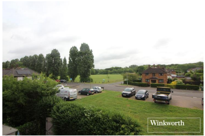
TEMPSFORD AVENUE, HERTFORDSHIRE, WD6 £235,000 LEASEHOLD