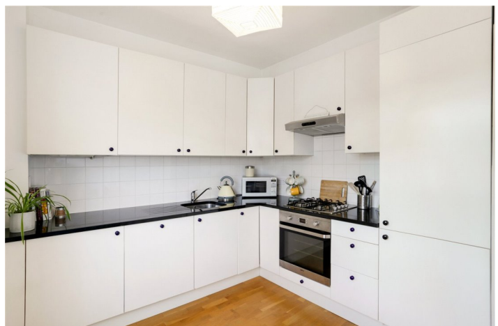
ELLERSLIE ROAD, SHEPHERDS BUSH, LONDON, W12 £1,725 PER MONTH £1,725 PER CALENDAR MONTH

A split level one double bedroom apartment on the first floor of a newly converted Victorian building.