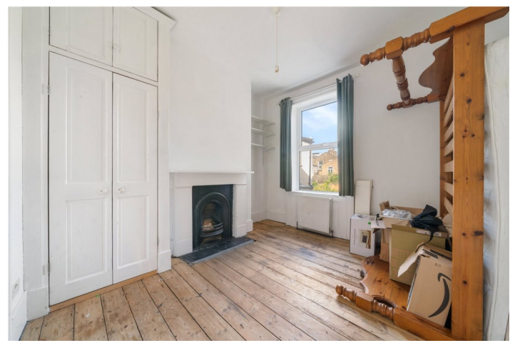
GLENARM ROAD, LONDON, E5 £1,250,000 FREEHOLD