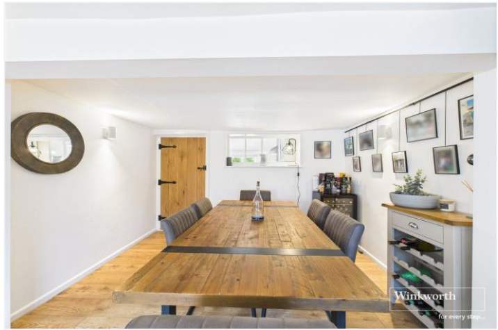
CHURCH LANE, THREE MILE CROSS, RG7 1HB GUIDE PRICE £550,000 FREEHOLD