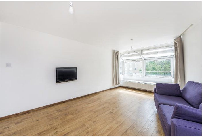
RAILTON ROAD, SE24 £260,000 LEASEHOLD