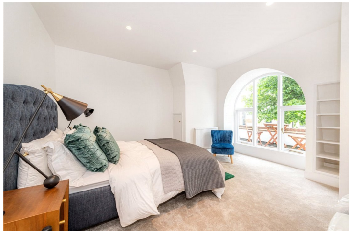
THE GATE HOUSE, LINDEN GARDENS, LONDON, W2 £1,350,000 LEASEHOLD