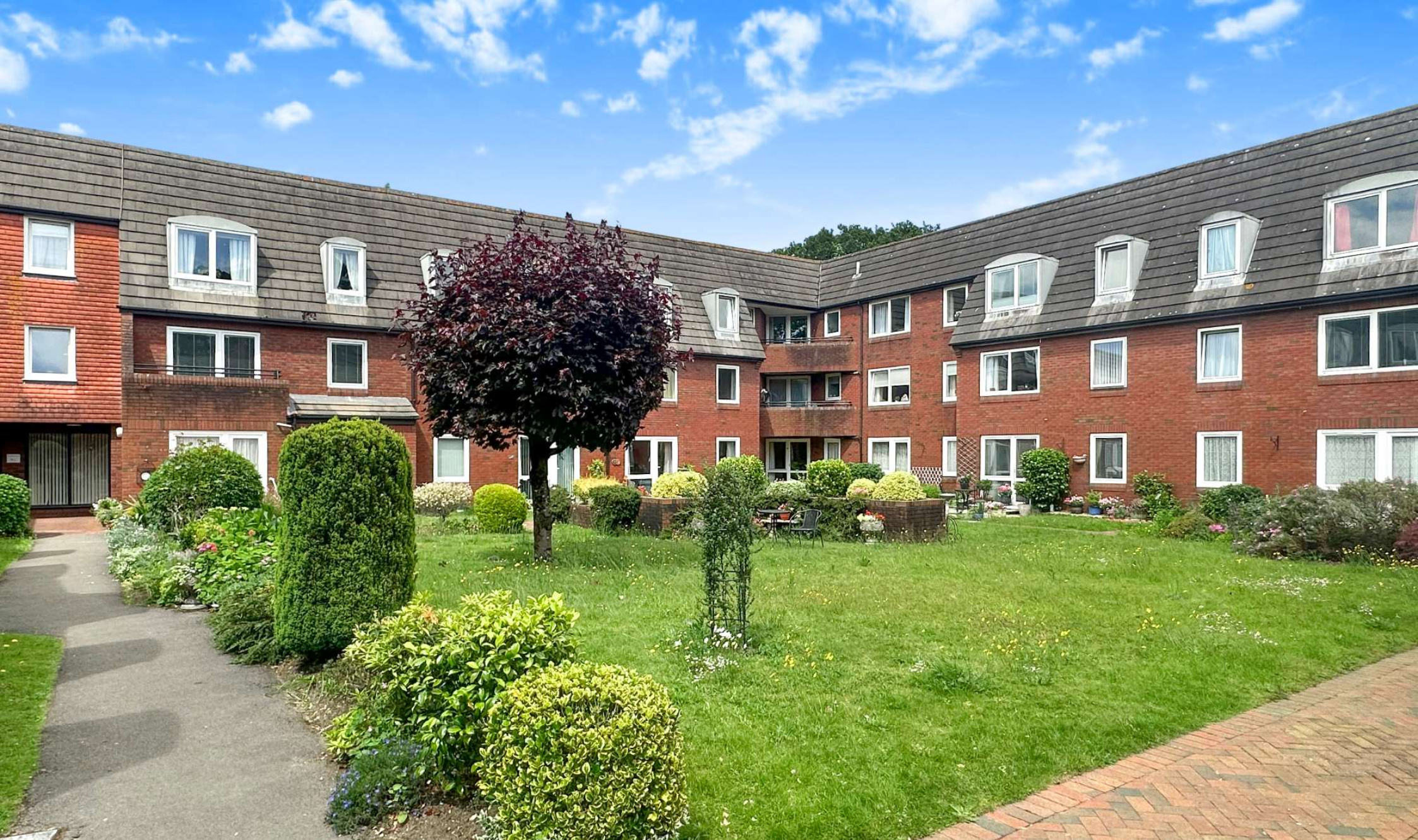
Homelands House, 535 Ringwood Road, Ferndown BH22 9DA Guide Price £75,000