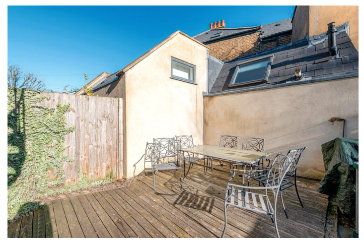
PAVILION TERRACE, WOOD LANE, LONDON, W12 £2,816.67 PER MONTH