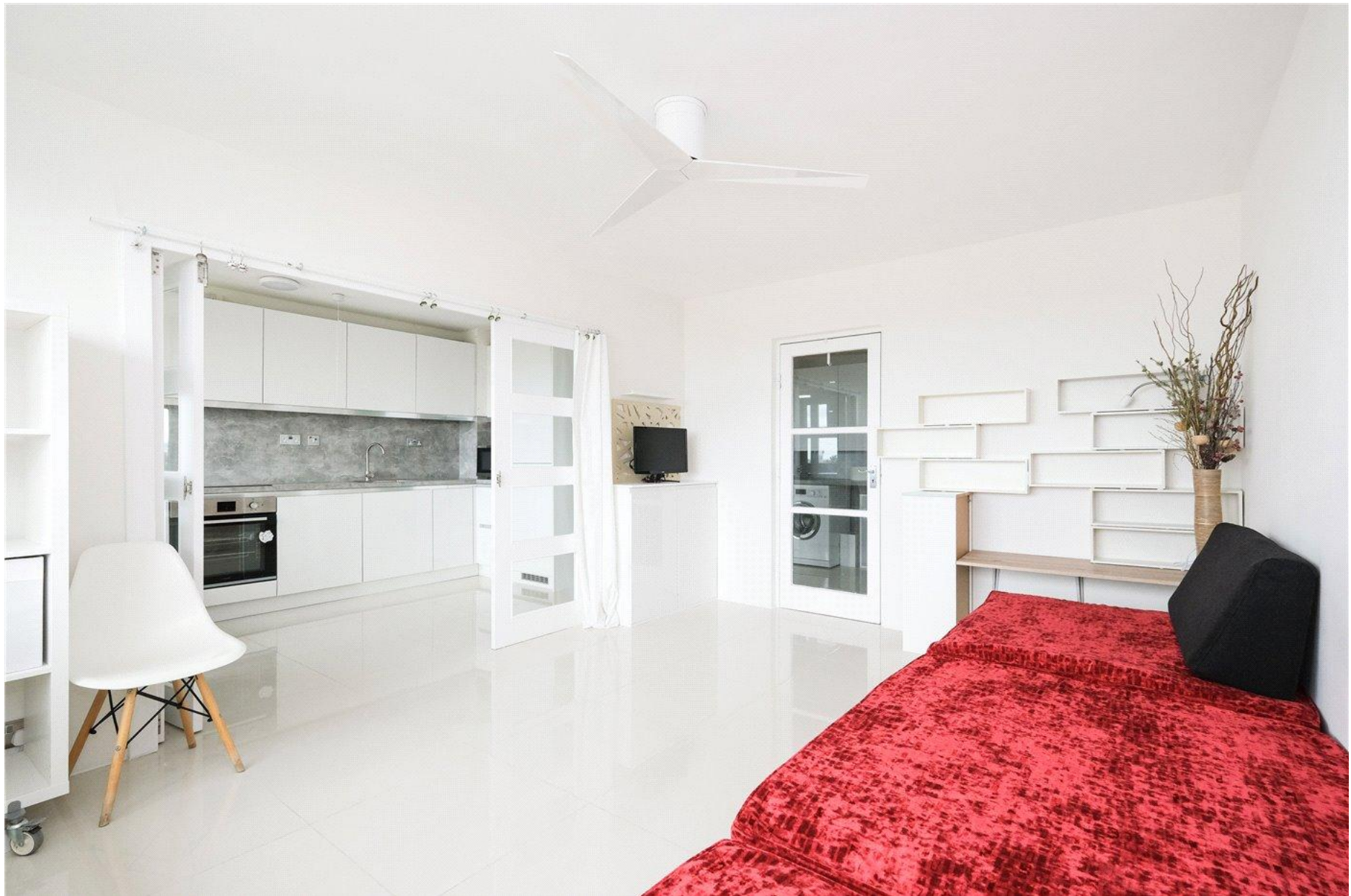
MICHAEL CLIFFE HOUSE, SKINNER STREET, EC1R £450,000 LEASEHOLD APPROX. 179 YEARS REMAINING