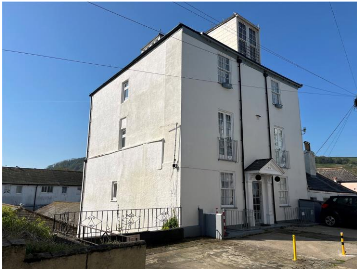
CLARENCE STREET, DARTMOUTH £160,000 LEASEHOLD