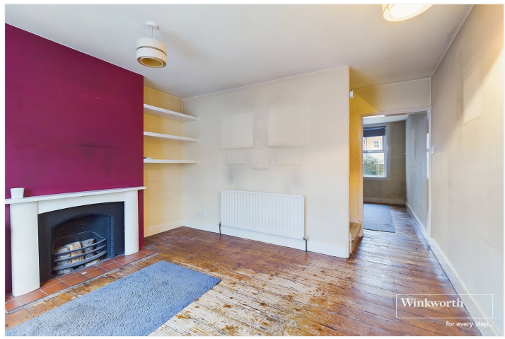
YORK ROAD, READING, RG1 OFFERS IN EXCESS OF £290,000 FREEHOLD