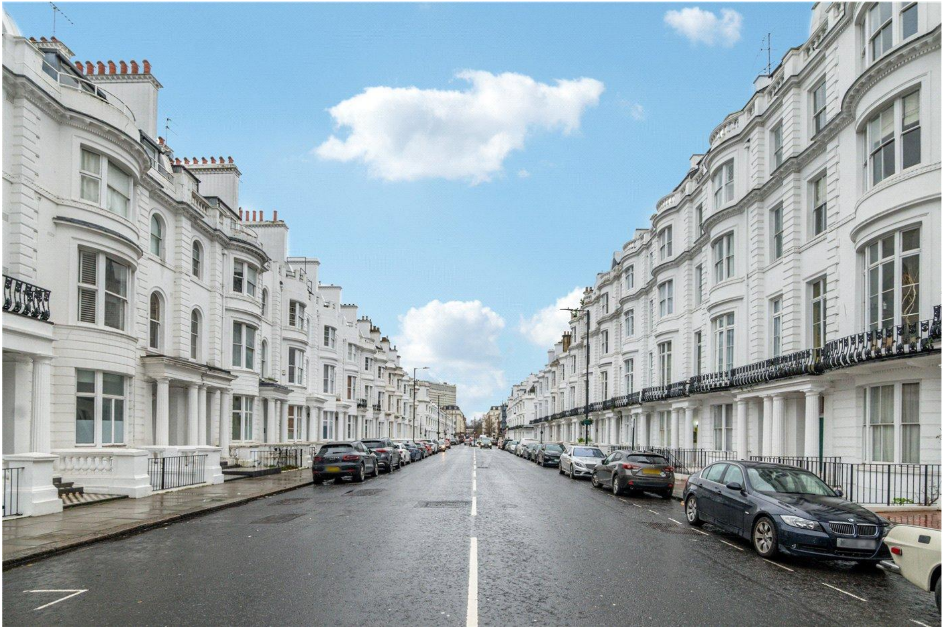
GLOUCESTER TERRACE, W2 £420,000 LEASEHOLD