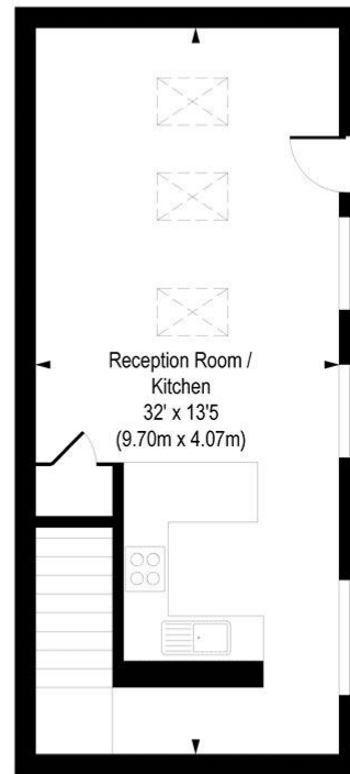
First Floor Gross Internal Floor Area 425 sq ft

COMPLIANT WITH RICS CODE OF MEASURING PRACTICE. Floorplan is for illustrative purposes only and is not to scale. Every attempt has been made to ensure the accuracy of the floorplan shown, however all measurements, fixtures, fittings and data shown are an approximate interpretation for illustrative purposes only. Liability for errors, omissions or mis-statement through negligence or otherwise is hereby excluded.