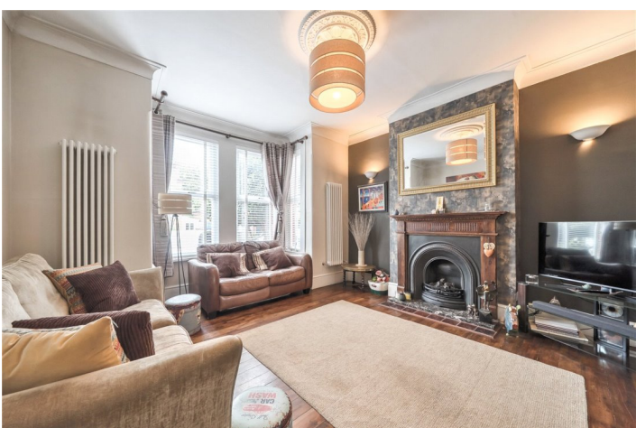
WOOLSTONE ROAD, LONDON, SE23 £950,000 FREEHOLD