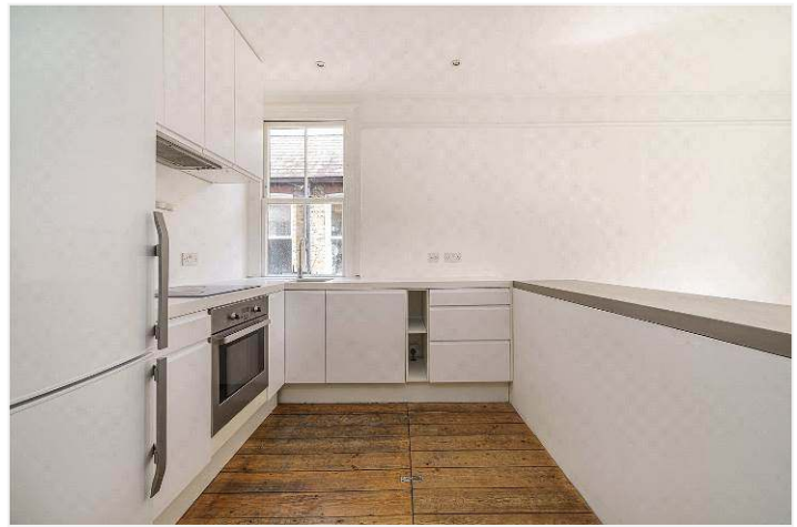
HINDMANS ROAD, EAST DULWICH, SE22 £675,000 SHARE OF FREEHOLD